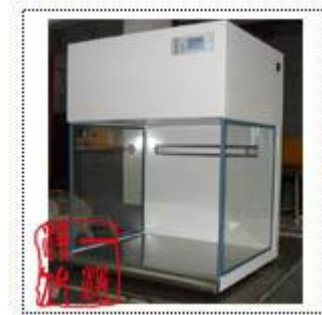
YJ-VD/HD table clean bench