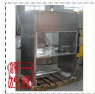
Stainless non-standard clean bench