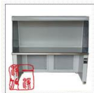
YJ-HS-2 double horizontal clean bench