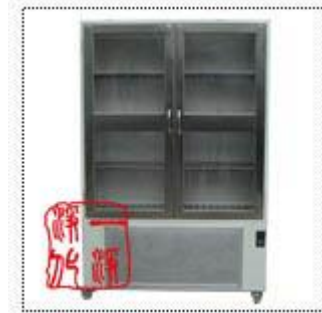
YJ clean cabinet(100Class)