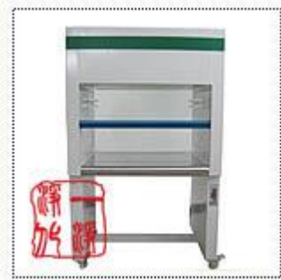
YJ-VS-1 Single Vertical Clean Bench