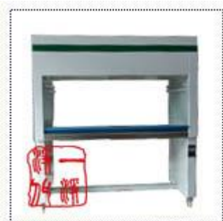
YJ-VS-2 double vertical clean bench