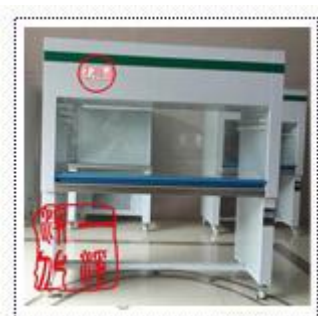
Medical Vertical clean bench