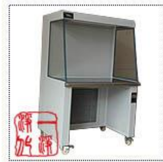
YJ-HS-1 single horizontal clean bench